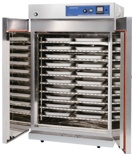
PW-120HL /HG (Above trays not included)