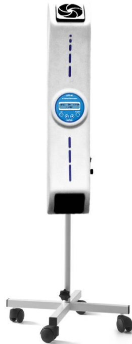
Figure 2. UVR-Mi recirculator on the stand