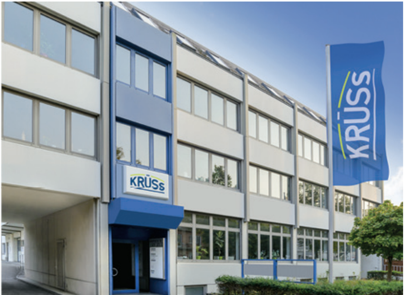
A.KRÜSS Optronic Headquarters in Hamburg

A.KRÜSS Optronic is a leading manufacturer of high-precision laboratory and analysis instruments. For more than 200 years we have been developing and manufacturing innovative product solutions for the quality control of raw materials, semi-finished products and end products in Germany.