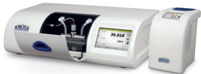
P8000-T with circulation thermostat PT80

When used in combination with polarimeters, the PT80 or PT31 circulation thermostats ensure uniform temperature control of the samples to be measured. This enables high-precision and reproducible measurements, such as those prescribed by different standards in the pharmaceutical industry at 20 °C or 25 °C. Water-temperable measuring tubes from all manufacturers can be temperature-controlled with our circulation thermostats and are connected in no time at all using the quick couplings for hoses integrated in our polarimeters.