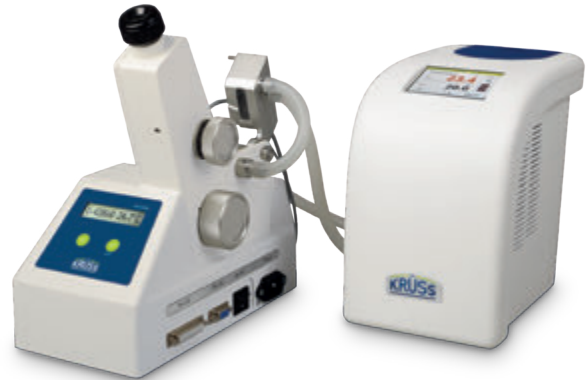
AR2008 with circulation thermostat PT80

The PT80 and PT31 circulation thermostats are often used for the sample temperature control of refractometers, whereby the temperature control of Abbe refractometers is particularly popular. Abbe refractometers can therefore achieve highly accurate and extremely reproducible measurement results completely independent of the ambient temperatures. The more powerful PT80 guarantees fast and stable temperature control of the measurement sample even in laboratories without air-conditioning. Both circulation thermostats are extremely small and can be very easily connected to all water-temperable refractometers.